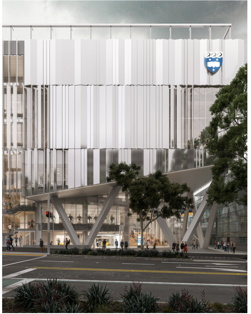
Warren and Mahoney - UoA - Recreation and Wellness Centre