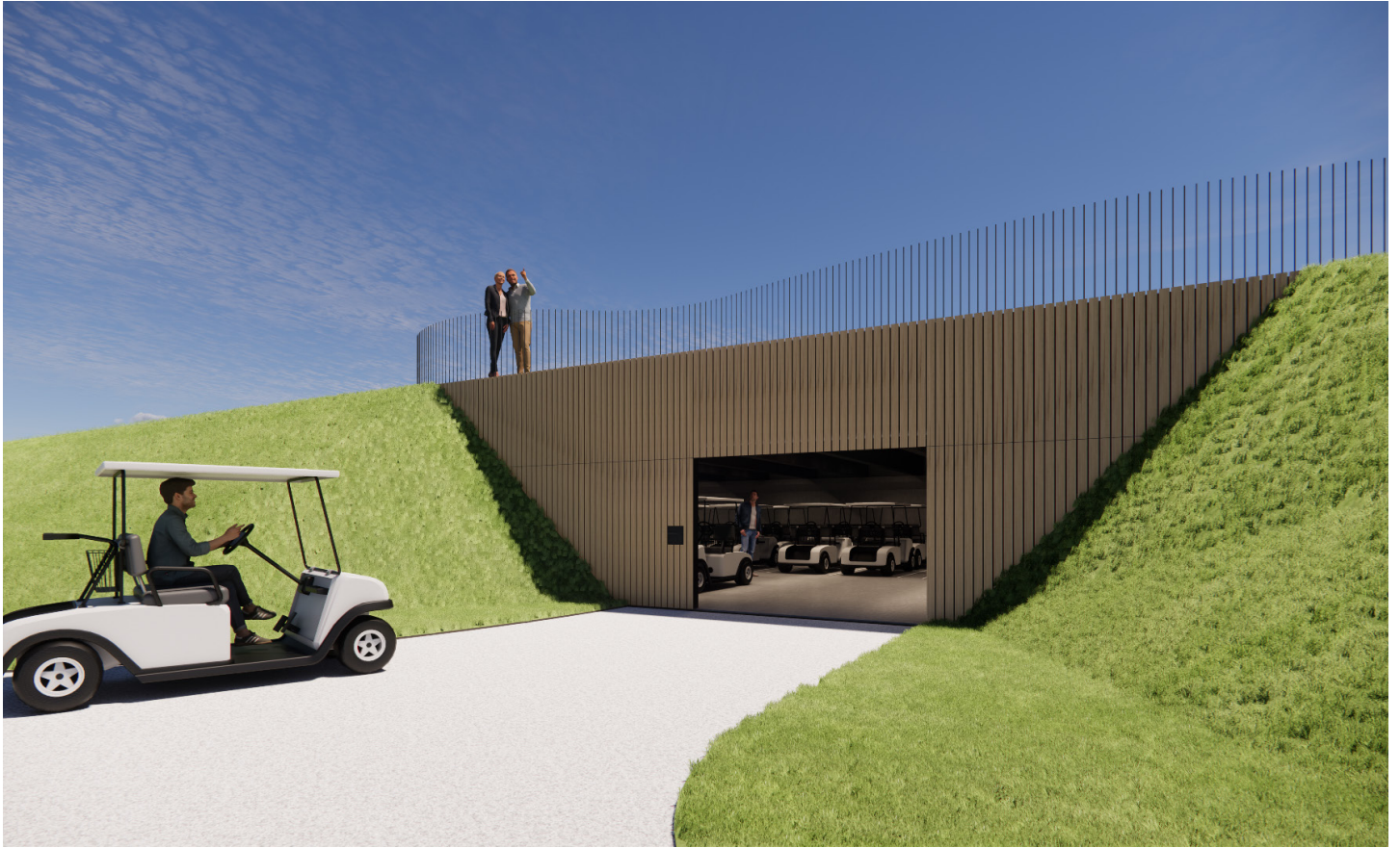
MCA - TAL - Cart Bunker