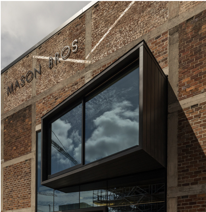
Warren and Mahoney - Mason Bros