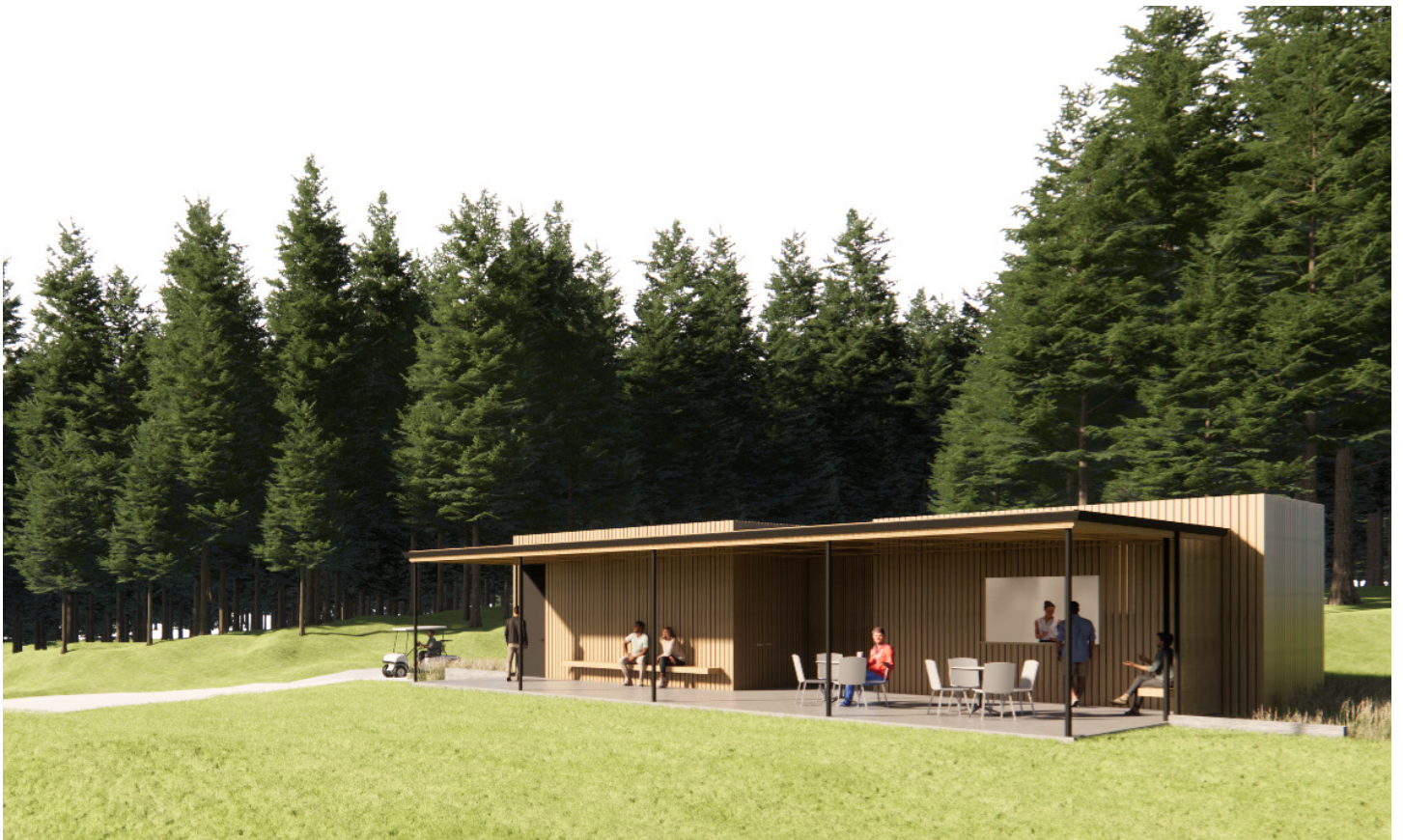
MCA - TAL - The Halfway House